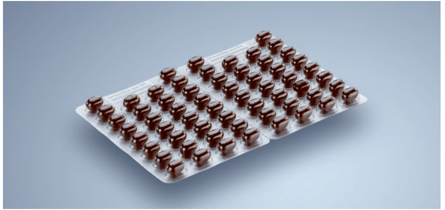
Perforated, twin blister pack with soft gelatin capsules. Specification: high productivity for large-sized blisters.