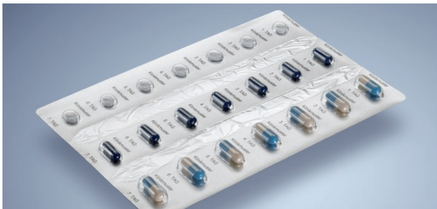
Large-sized blisters for clinical trials. Specification: reliable packaging of 7x3 weekly medication packs.