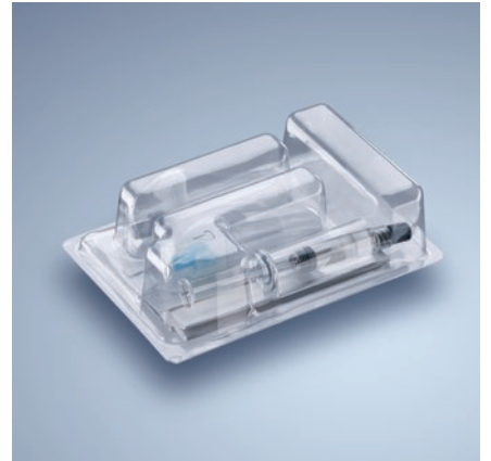
Combination blister for syringe and needles. Specification: efficient handling of the smallest of batches.