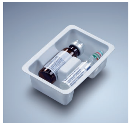
Unsealed combination blister for vial and ampoule. Specification: high-performance packaging.