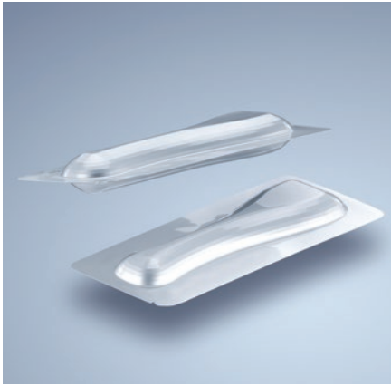
All-aluminum, blister-to-blister pack for applicator. Specification: a reliable packaging process with maximum output.