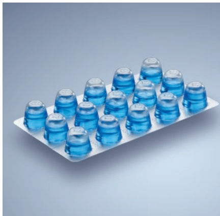
Gel blister. Specifications: accurate dosing of liquids of low viscosity as well as maximum machine availability.